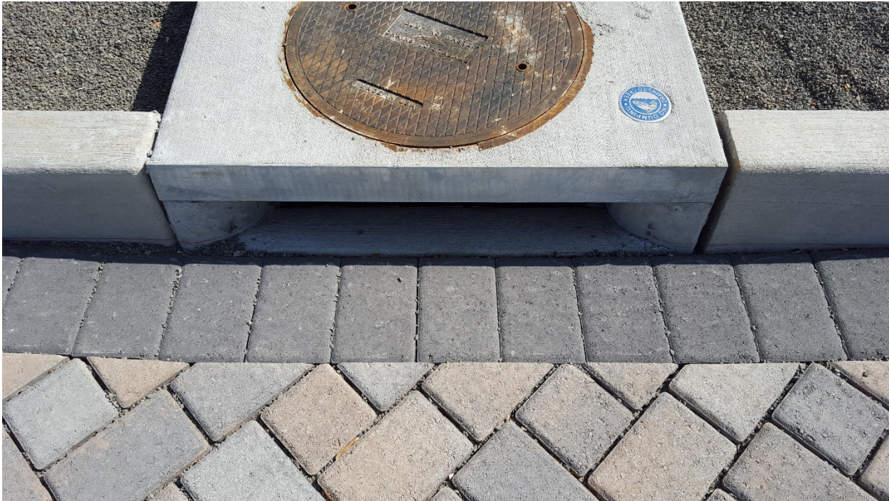
Figure 4.3. Permeable pavers intercept rainfall and infiltrate it into the ground, the catch basin will only receive runoff from large storm events.

Pervious surfaces (also known as permeable pavements and porous pavements) are stormwater management facilities that allow water to move through void spaces within the pavement surface and rock below and infiltrate into underlying soils.