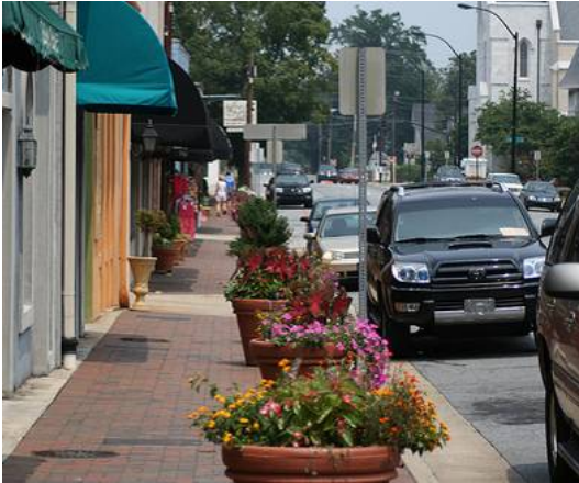
Figure 4.4. Contained planters are a common beautification project that benefit the watershed when placed over impervious surfaces. In a dense, “main street” application like this photo, the planter footprint shouldn’t exceed the width of the furnishing zone ( i.e. the pavement area between the curb and the walking area of the sidewalk), which is the area where signs, benches, parking meters or other similar infrastructure might be placed. This will ensure that sidewalk traffic is not impeded by a narrowed throughway.

Contained planters placed over existing impervious areas, on the ground or roof, intercept rainfall and then evaporate it back into the air, even in the winter. As an alternative to depaving, place a potted plant anywhere there is unused pavement. Acting much like vegetated roofs, contained planters can reduce annual runoff by 40% to 60% from the area on which they are placed while also improving the aesthetics of paved areas.