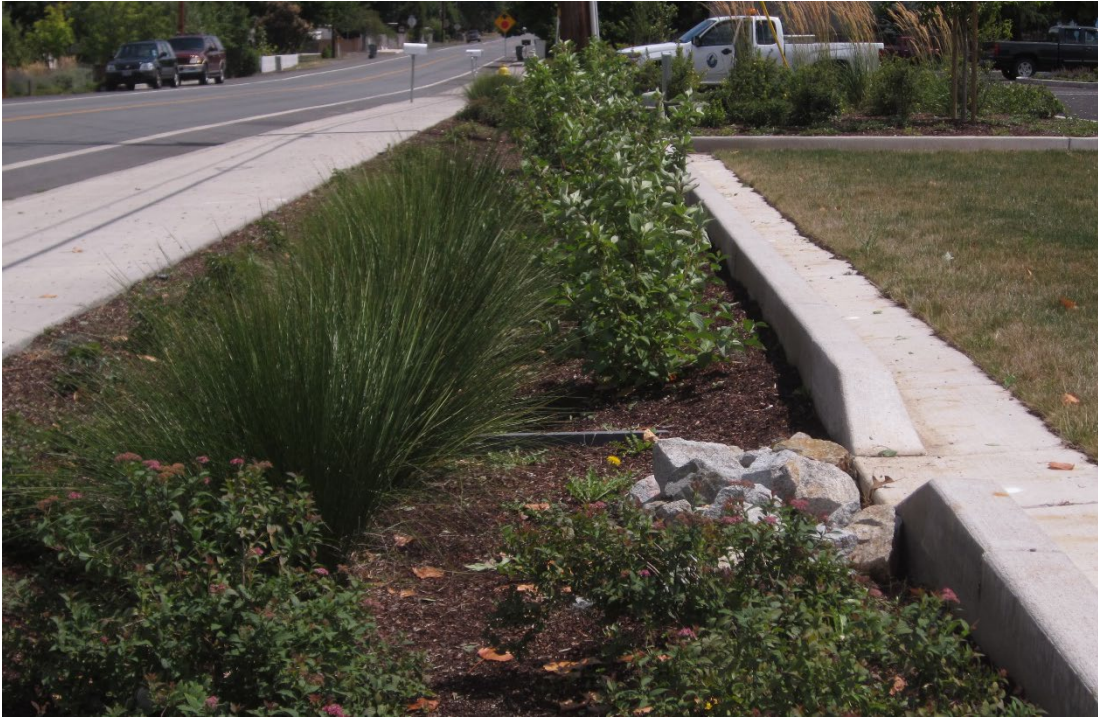
Figure 4.6. An LID swale with check dams to slow the flow of water and increase infiltration.