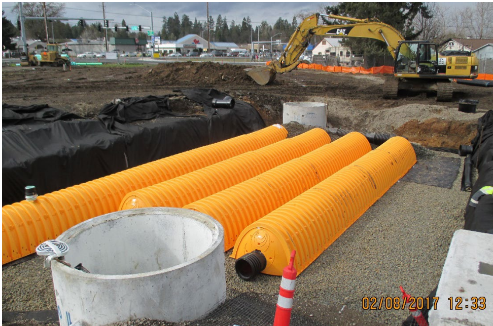
Figure 4.11. Stormtech Chambers are one example of a stormwater treatment technology that has been pre-approved by the Rogue Valley Stormwater Advisory Team.

Proprietary treatment devices may be used when Low Impact Development and Green Infrastructure are determined to be infeasible and where the soil is not Hydrologic Soil Group A or B. The proposed treatment device must either be on the list of Pre-Approved Proprietary Stormwater Treatment Technologies for use under the Rogue Valley Stormwater Design Manual , located in Appendix G , or on the Washington Department of Ecology's Technology Assessment Protocol – Ecology (TAPE) Approved Stormwater Technologies List , https://ecology.wa.gov/Regulations-Permits/Guidance-technical-assistance/Stormwater-permittee-guidance-resources/Emerging-stormwater-treatment-technologies . Depending on the device chosen, a treatment train approach may be needed. Devices from the TAPE approve list must meet the following criteria: