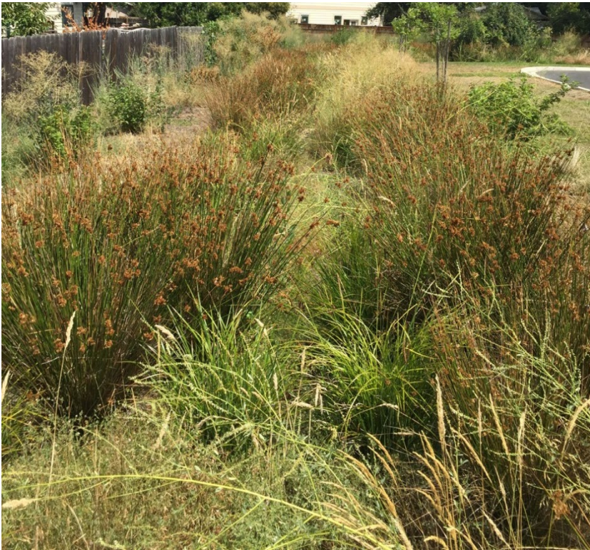
Figure 4.10. A water quality conveyance swale with dense mature vegetation that provides filtering of stormwater runoff.

Water quality conveyance swales treat stormwater by conveying it through the substrate and vegetation, rather than relying on infiltration. These facilities are not considered LID because water quality treatment is mainly achieved by filtration and settlement provided by the plant structure and growing medium rather than infiltration and evaporation. Swales must be planted with dense vegetation to filter the stormwater and should be integrated into the overall site design and used to meet landscaping requirements.