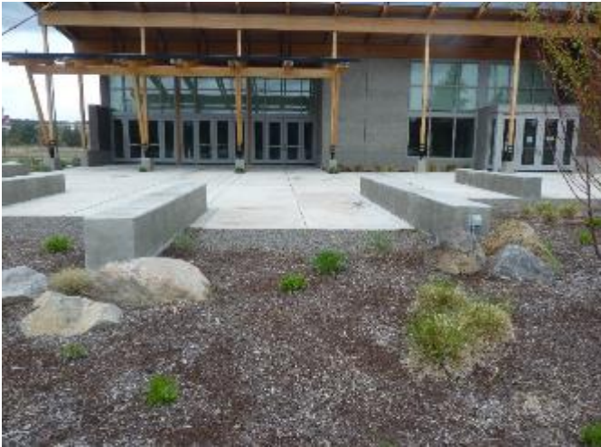
Figure 4.9. Example of sheet flow from a patio to a newly installed vegetated filter strip.

Dispersion is a BMP that spreads runoff over a landscape area specifically to reduce pollution and runoff, and is suitable for a variety of roadside applications and development densities. Vegetated filter strips typically run parallel to an impervious surface, commonly walkways and driveways, and are gently sloped away from the impervious surface. They must be completely vegetated to filter and reduce velocity as runoff flows through. Downspout disconnection redirects runoff from an underground stormwater pipe to a landscaped or mulched area for infiltration.