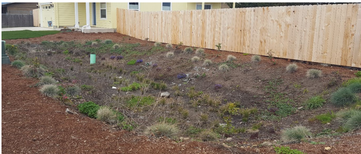
Figure 4.5. Neighborhood scale residential rain garden six months after installation.