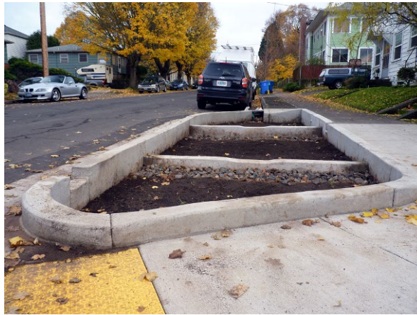
Figure 4.7. A residential above-ground stormwater planter (left). An in-ground stormwater planter with concrete check dams in a public street before planting (right). The centerline (looking straight up the center of this photo) slopes at less than 1%. Concrete check dams were needed because the street slopes more than 1%. Grades parallel to the check dam are flat.