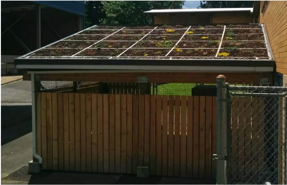
Figure 4.1. Growing medium on this small vegetated roof was stabilized with lumber to keep it from sliding down the steep slope.

Vegetated roofs are roof system assemblies that manage stormwater by holding rainfall in the pores of the growing medium, the drainage layer below if used, and by plants. While the term “green roof” is a more commonly used term, the term “vegetated roof” is more appropriate for much of Oregon which has dry summers, where some plants are dry and inactive until the rainy season begins again.