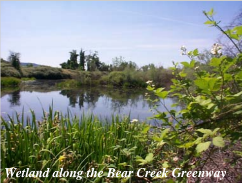
Wetland along the Bear Creek Greenway

Protecting the storm drain system is important because most of the runoff that enters the storm drain system ends up in Bear Creek and the Rogue River. Runoff entering storm drains is not routed to or treated by a wastewater treatment plant.