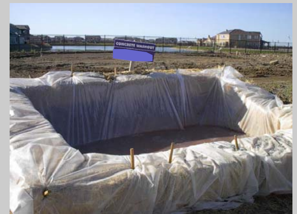
An example of a properly designed concrete washout. Washouts can be scaled down for use on smaller projects.